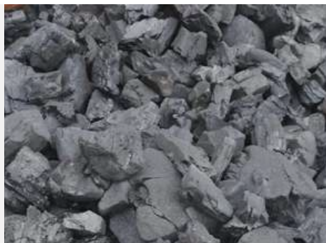
Mophani 2-4 cm