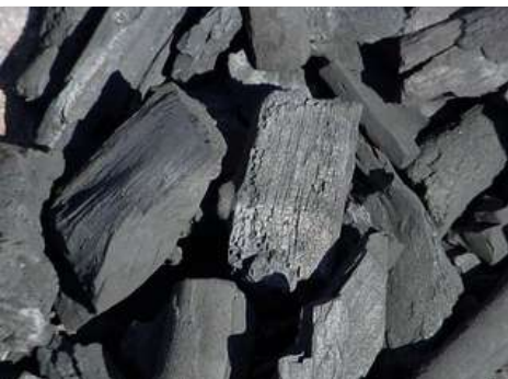
Oak 1-8 cm