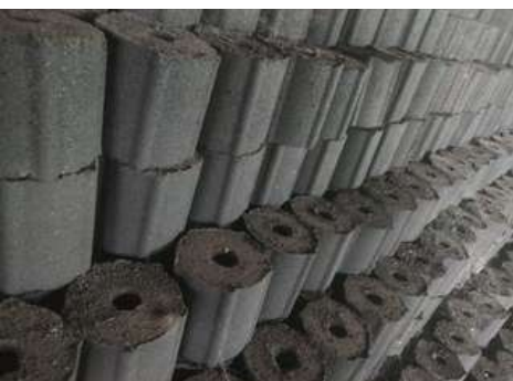
Briquettes 4-10 cm