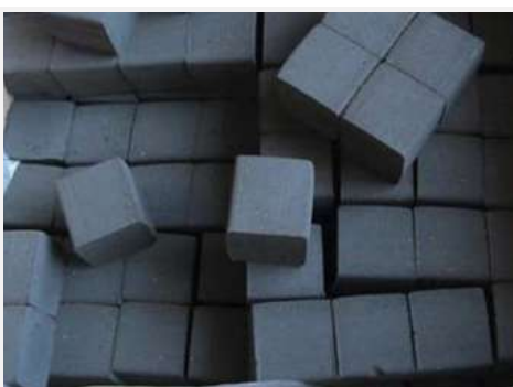
Coconut Cubes 2,5-2,5 cm