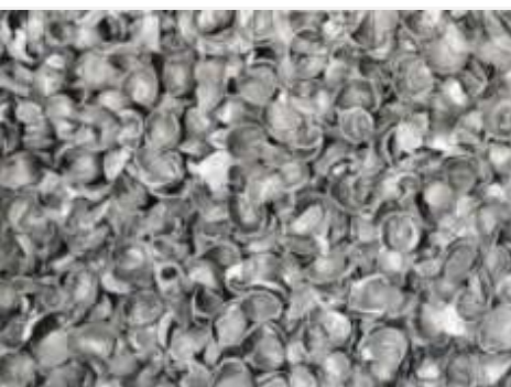
Hazelnut 1-2 cm