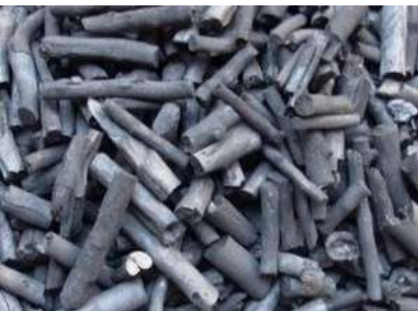
Marabou 1. Quality 4-10 cm