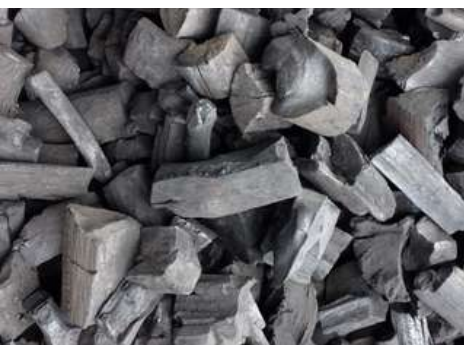
Restaurant type 2+ cm