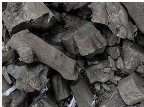
Orange 2-8 cm