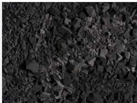
Marabou Powder 0,2-1 cm