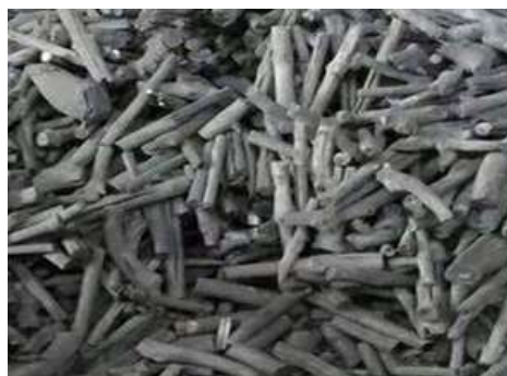
Shisha Type 2+ cm