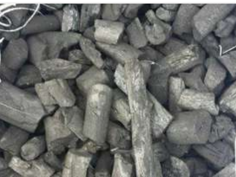
Marabou 2. Quality 2-4 cm