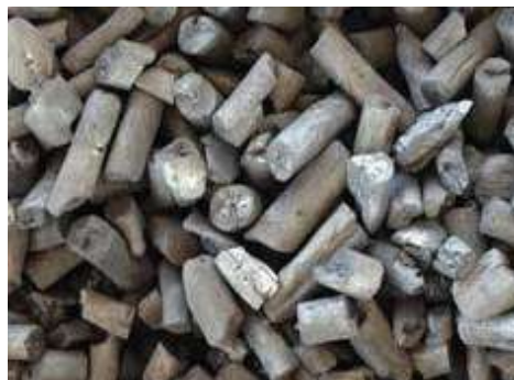
Marabou Carbonilla 1-2 cm