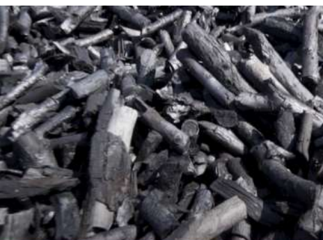
Moshara 2-4 cm