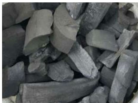
Lemon 2-8 cm