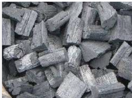
Pure Ayin 2+ cm