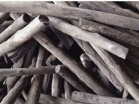
Marabou Canelino 5-15 cm