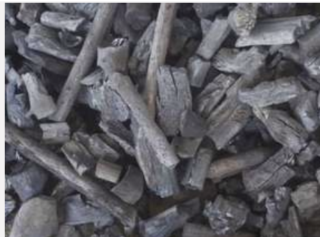
Marabu Carbonilla Mejorada 1-4 cm