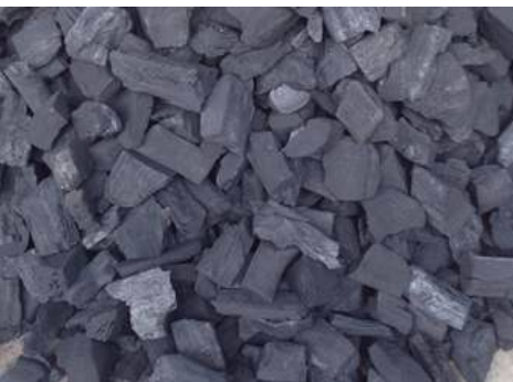
Acacia 2-4 cm