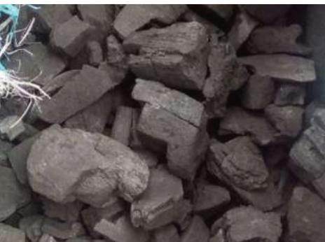
BBQ type 2+ cm

BURNING TIME 3-5 HOURS 6500 CALORIES FIX CARBON 76-82%